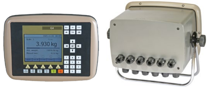
Panel Mount (PM)

A large (5.7 in) color touch screen facilitates quick, easy operation and simplifies parameter changes. The screen displays up to 4 weighing/force channels simultaneously, allowing the user full control of multiple process vessels. The large touch screen provides good visibility of the process and easy navigation through parameter menus and settings.